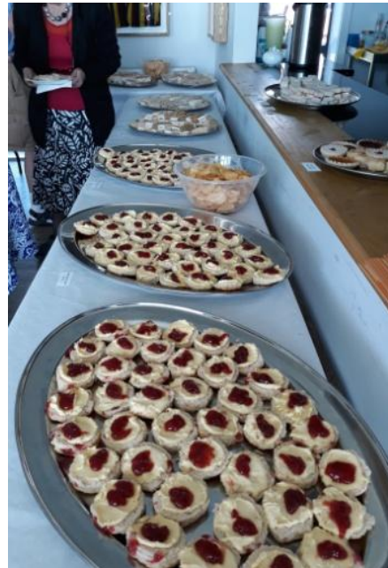
Cream tea – the Devon way !