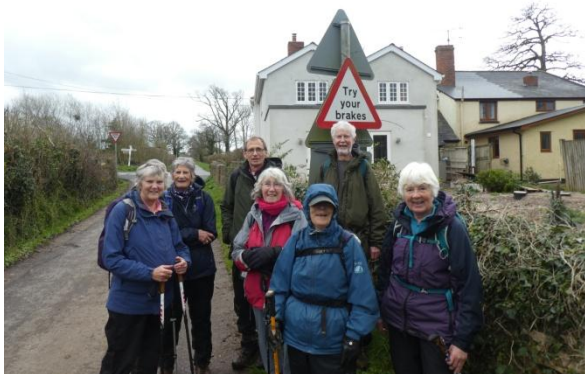
All members kept to the pace and 'no brakes were needed'!