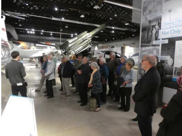
The group on the guided tour with a guided missile behind.

Concorde first took to the skies on 2nd March 1969, with the first flight from Filton on 9th April 1969. To celebrate Concorde's fiftieth anniversary, members were treated to a fascinating tour of Concorde Alpha Foxtrot – the last Concorde ever to fly.