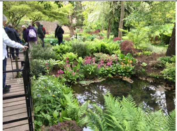
One of the wells feeding the city.