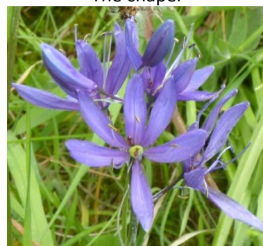
Camassia (N.American wild hyacinth)