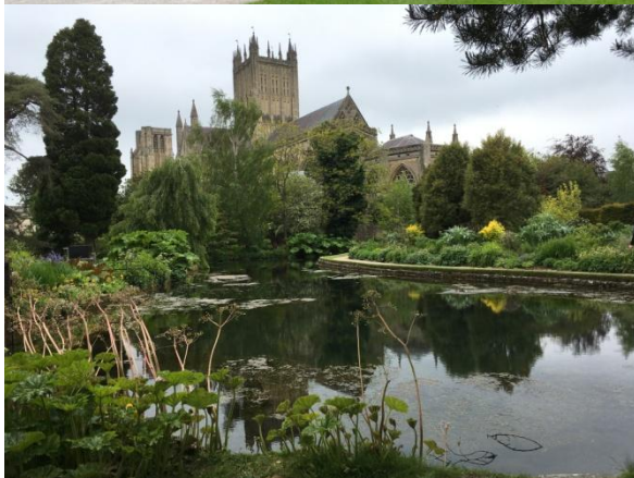
View of the Cathedral and swans