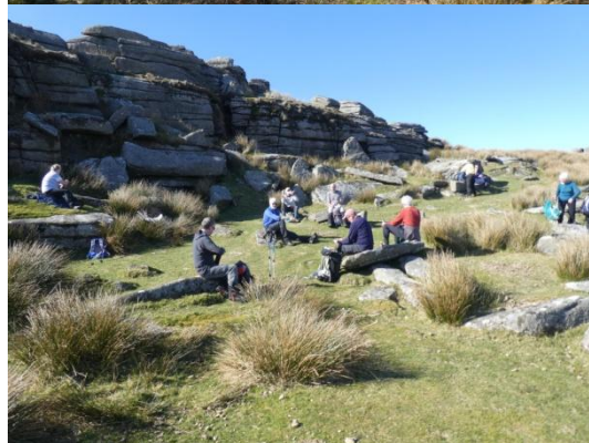
Lunch at Oke Tor