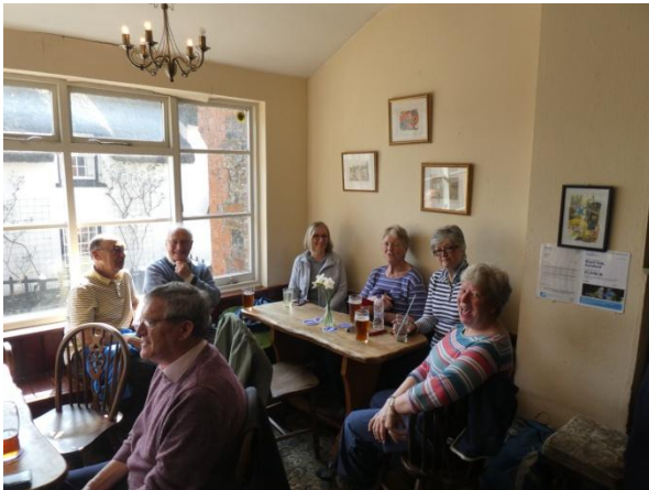
Refreshments at The Royal Oak Inn