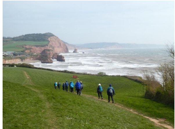
The group walking towards Ladram Bay with wild waves beyond

Walkers followed the coastal path to Ladram Bay, descending into Colaton Raleigh, with a gentle walk along the river to Otterton.