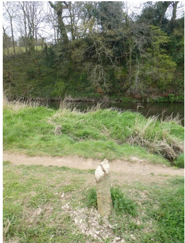
Beaver-carved stump by the River Otter