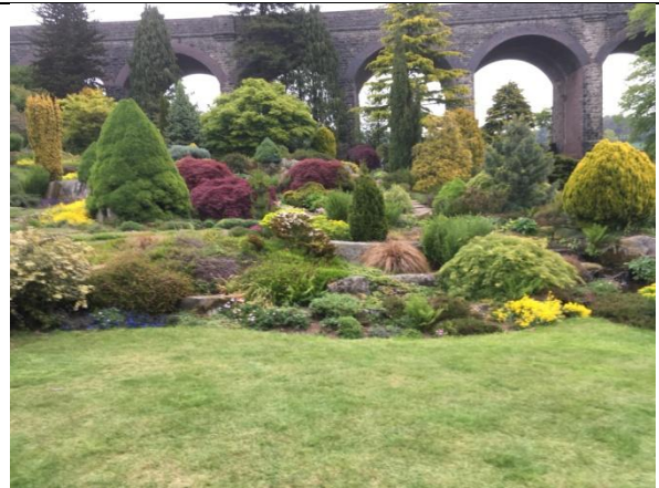
Kilver Gardens and Charlton Viaduct