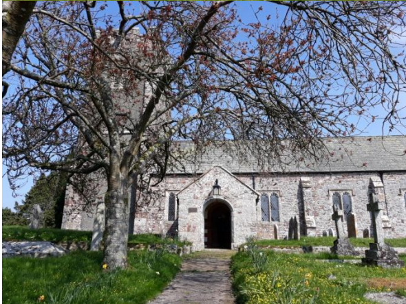
Holcolme Burnell church