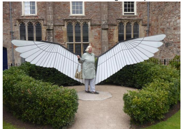
Modern sculpture in the Bishop's gardens.