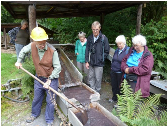
Twenty members enjoyed a walk and tour of the iron mine, which closed in 1951. Members traced the whole process from mining the ore, via the adit and shaft, to the dispatch of the final product from the drying shed.