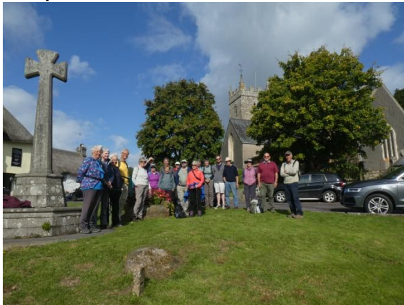
UERSA members at Lustleigh on their way to visit Kelly Mine