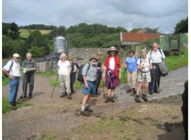
Rare event – needed to shelter under trees for the picnic – a heavy storm but fine again when we walked afterwards