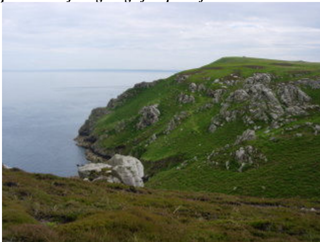
Lundy- Seals and Soay sheep spotted but not on the photos! Major sighting of dolphins from boat