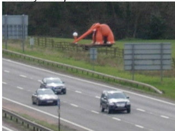
March – Shillingford & Ide – ORANGE ELEPHANT! Excellent farm shop and tea-room too