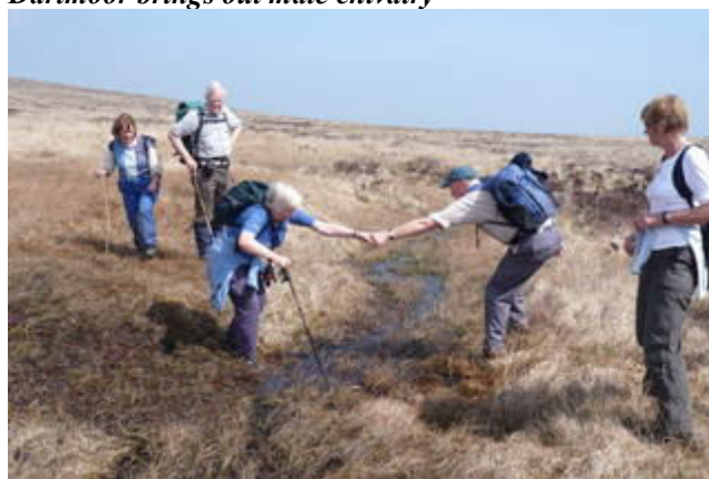
April – South Zeal & Cosdon Hill Dartmoor brings out male chivalry