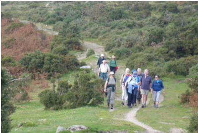
September – New Bridge