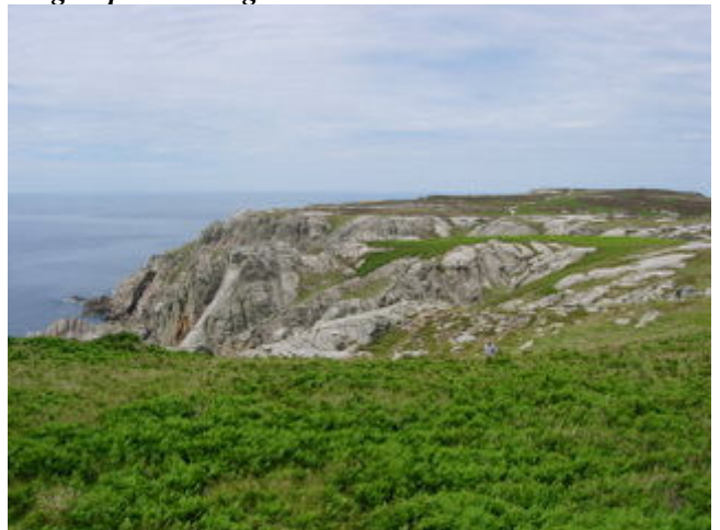
Lundy - Spotlight recording – unfortunately no-one from the group in the August transmission