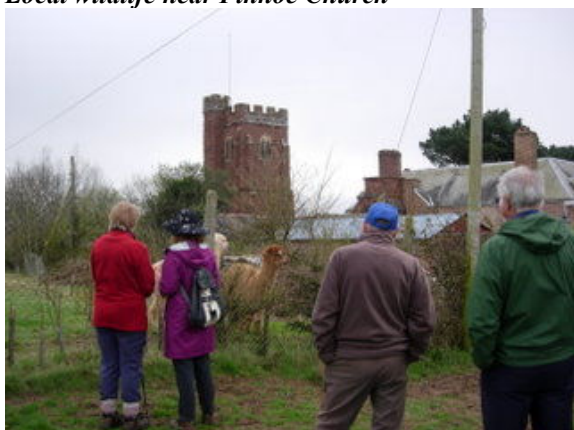
April – Beacon Heath Local wildlife near Pinhoe Church