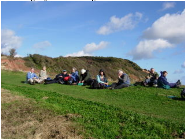
October – Exmouth – Budleigh Salterton Picnicking in fantastic sun again!