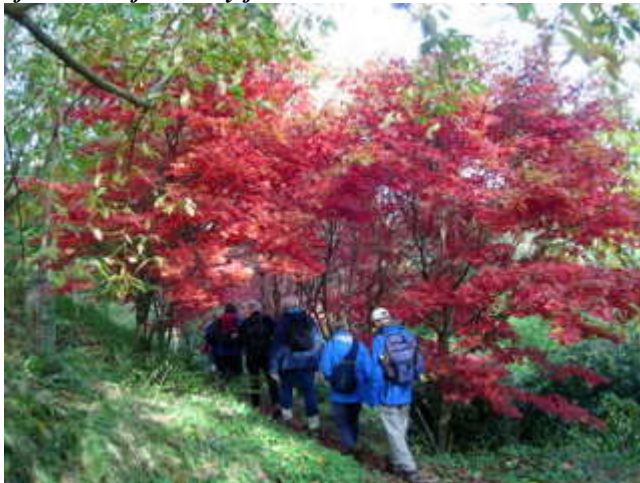
November – White Cross & River Otter – less than a week after the awful Ottery floods