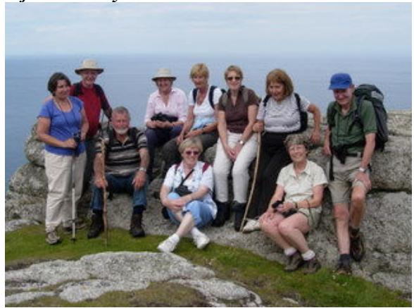
June – Lundy A fabulous day