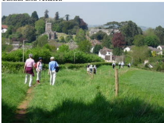
May – Newton St. Cyres Casual and relaxed