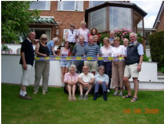
June – Exwick 50 th walk – picnic, punch and desserts