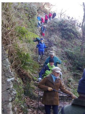
December – Hunter's Path, Fingle Bridge