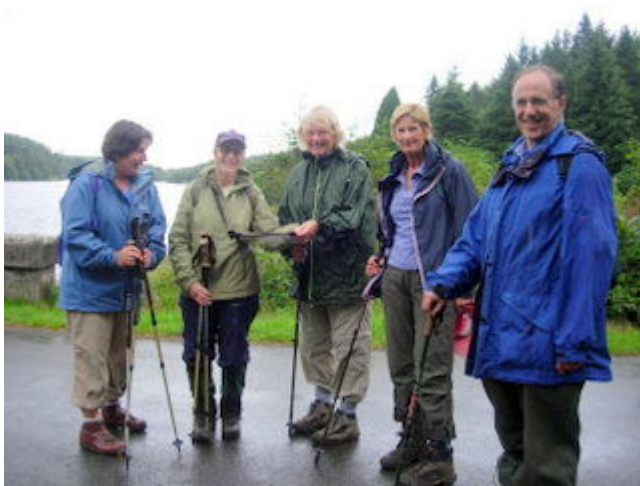
August- Christow – Tottiford Reservoir