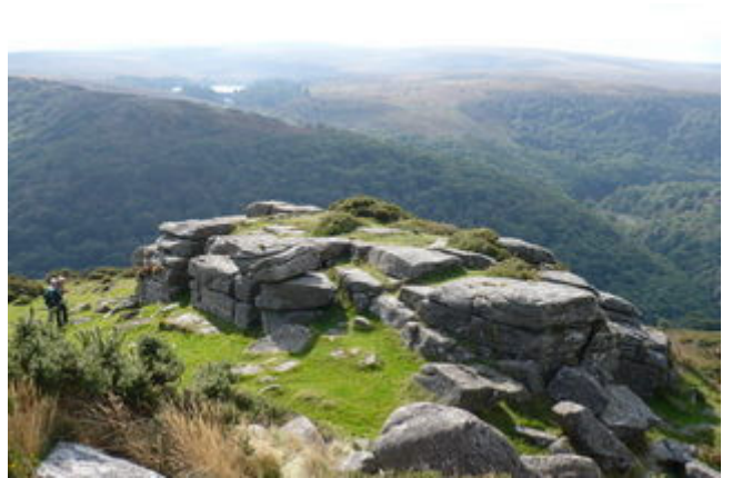
Wonderful Dartmoor again