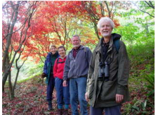
Incredible Autumn colours