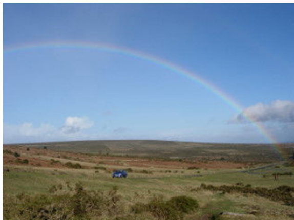
February – Haytor with rainbow – picnic for all seasons