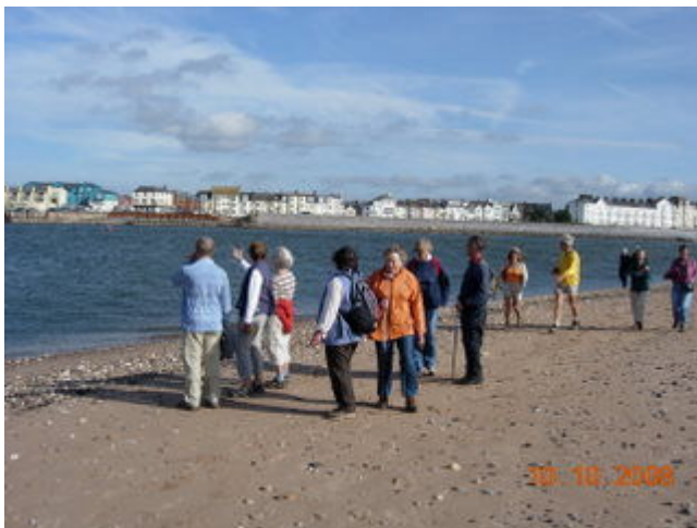
October – Dawlish Warren– return ‘round trip’ planned