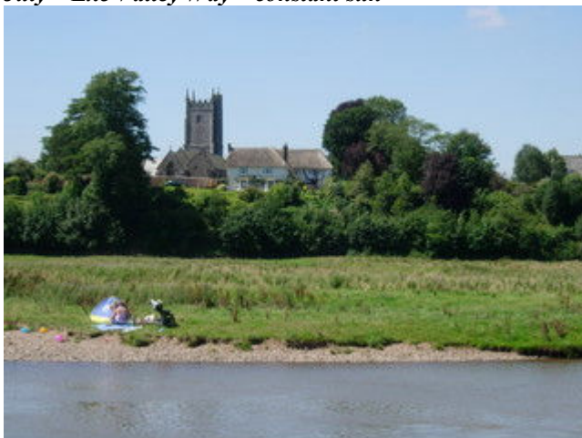
July – Exe Valley Way – constant sun